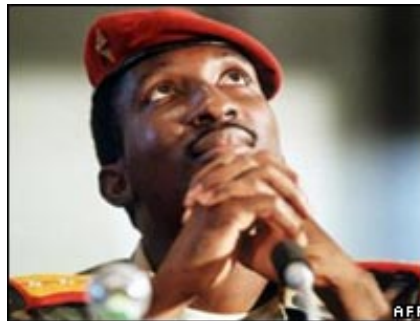
Thomas Sankara was overthrown by the current president

Burkina Faso is paying tribute to its late revolutionary leader, Thomas Sankara, on the 20th anniversary of his assassination.